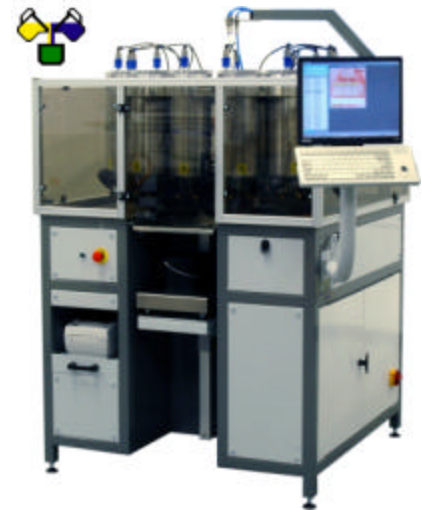
Model CD14 Automatic

'This compact dispensing system releases valuable labour, saving time, ink and ensuring accurate and repeatable ink formulation time after time.'