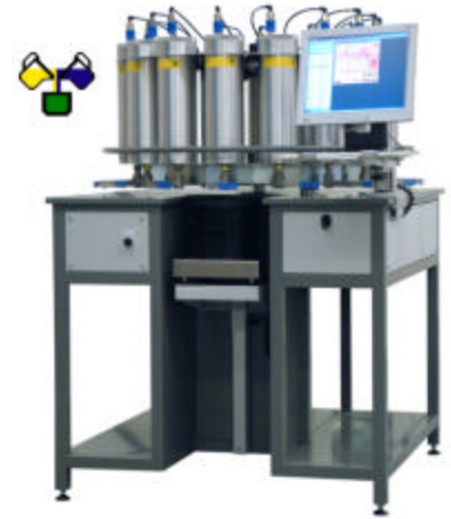
Model CD14 Manual

'This compact dispensing system releases valuable labour, saving time, ink and ensuring accurate and repeatable ink formulation time after time.'